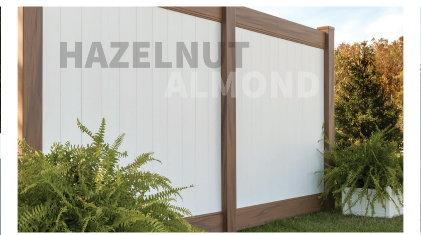
SIGNATURE is the perfect way to add beauty and value to your home